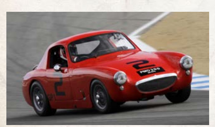
PMO 200 on track

As of mid-January, we had ten cars registered for Concours Judging, a very strong turnout. For those of you who may not be familiar with this aspect of Conclave, Concours Judging allows an owner to have his car (usually a fresh